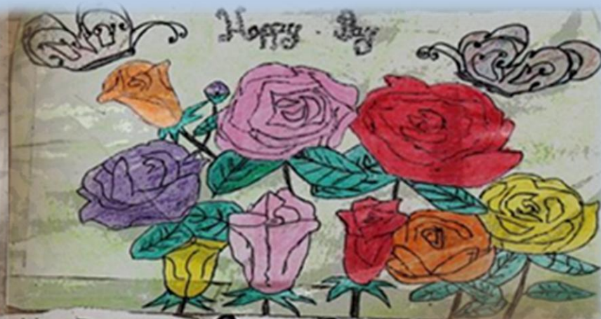
Art by Ruxa