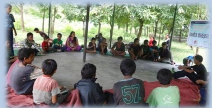
Children participating on picnic program organized by Eastern Region Program, VOC on the occasion of Dashain festival.